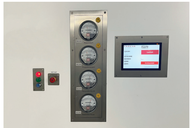
MODI 110 – IIoT HMI room display

This system is also maintenance-friendly: for servicing, the MODI units can be easily removed from the frame after removing the silicone – and just as easily reinstalled and resealed. A total of 24 MODI 110 IIoT HMI room displays are now in operation at the Feucht facility.